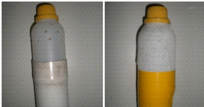
Figure 2. Peeping bottle designed to collect porewater sulfide. The upper side of the bottle had holes around it, covered with a soft net, and was connected to a PVC pipe

Site 4 had densest mangroves (1750 mangroves/ha) and was dominated by R. mucronata as much as 1417 mangroves/ha (Table 1). At each site, six mature trees of Rhizophora sp. were chosen as study objects and served as replications. The trees had similar heights, diameters, and visual health.